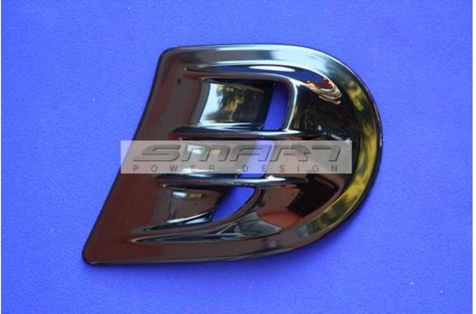
Photo 1: The Side Air Intake Scoop for Smart Fortwo 453 by Smart Power Design