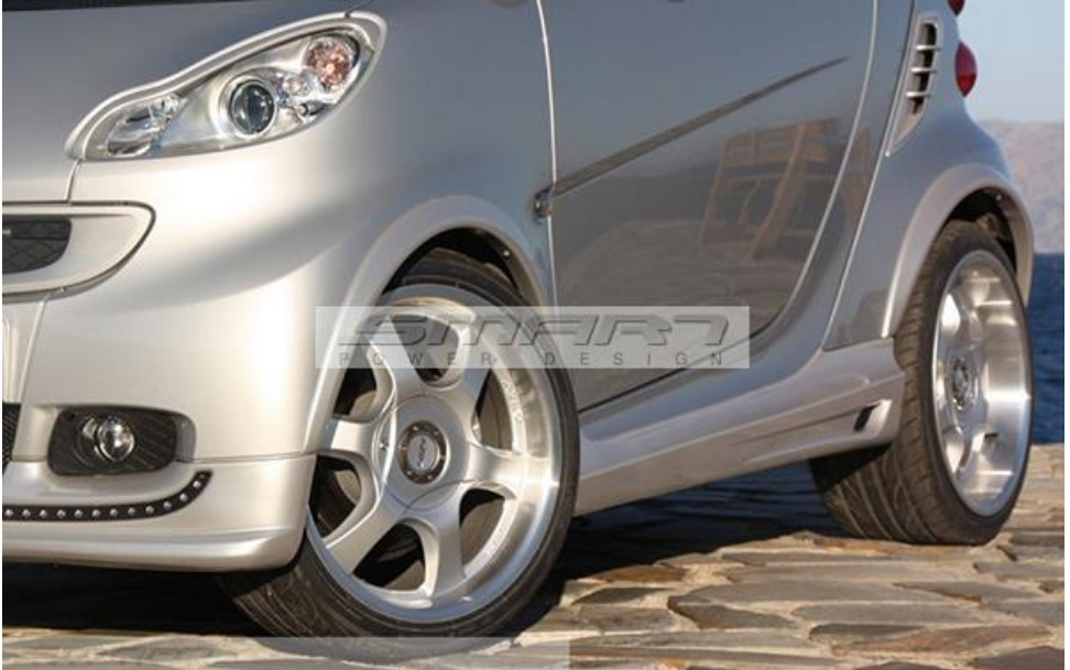
Photo 1: Side view of Smart Fortwo 451 with Smart Power Design's Fender Flares ( front and rear Fender Flares).

All work should be performed with the utmost care to avoid any damage.