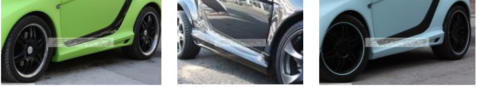
Side Skirts in different colors

Enjoy what you have just installed. We hope that you are not going to like it but to love it as it fits perfectly on your lovely Smart Fortwo 451.