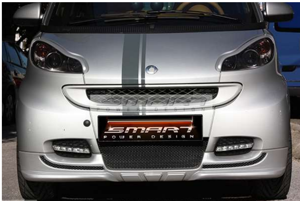
Photo 1: Front view of Smart Fortwo 451 with Smart Power Design's Front Spoiler ( without Daytime Running Lights).

All work should be performed with the utmost care to avoid any damage.