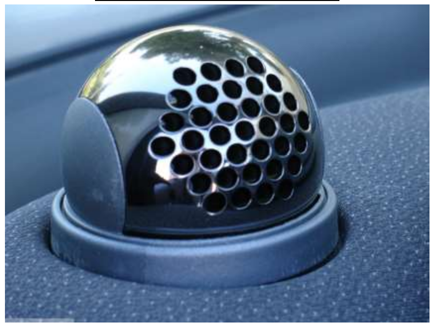
<u>Photo 1:</u> Smart Power Design's Air Condition's Ball for the Smart Fortwo 450 (photo inside the car).

All work should be performed with the utmost care to avoid any damage.