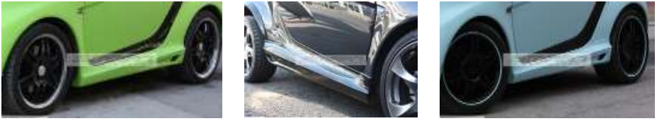
Side Skirts in different colors

Enjoy what you have just installed. We hope that you are not going to like it but to love it as it fits perfectly on your lovely Smart Fortwo 451.