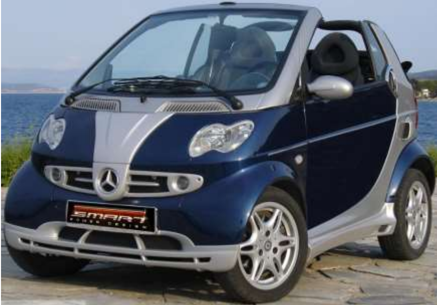
Photo 1: Side view of Smart Fortwo 450 with Smart Power Design's Fender Flares.

All work should be performed with the utmost care to avoid any damage.